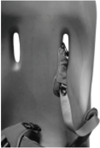
Step 1 Unclip right chest strap and slide strap through left shoulder slot