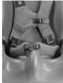
Step 6 Reattach the chest clip to the bottom of the right side of the chest harness