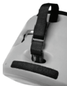
Step 2 Tread strap under sitter on top of loop and up right waist slot