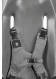
Step 3 Clip to the top of the right shoulder chest harness