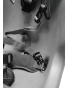
Step 4 Unclip right lateral strap and slide strap through left waist slot