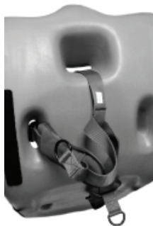
Step 2 Right waist strap up through right slot