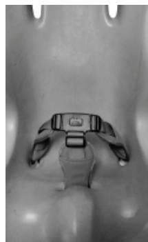
Step 4 Clip buckling