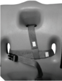
Step 5 Tread strapping under through crotch loop and up and out the right slot