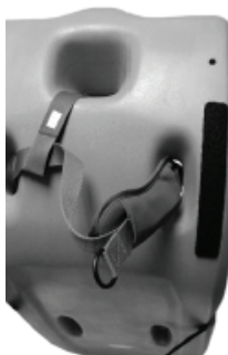
Step 3 Left waist strap up through left slot